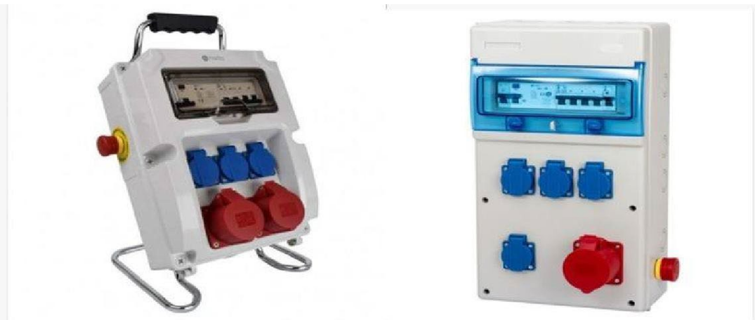
Single-phase + three-phase pre-equipped site box with emergency stop